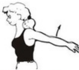
7. Bicep Stretch (hands apart)