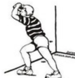
25. Gastrocnemius Stretch (keep knee straight and heel down, feet facing forward)