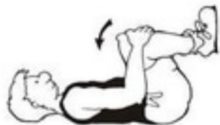
13. Lumbar Flexion Stretch (be gentle if sore)