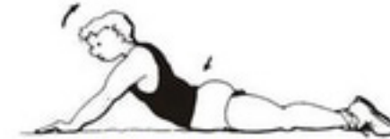
12. Lumbar Extension and Abdominal Stretch (be gentle if sore)