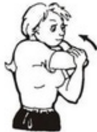
8. Supraspinatus Stretch (keep elbow parallel to ground)