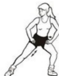
22. Adductor Stretch (keep foot pointing forward, lunge sideways on bent knee, keep back straight)