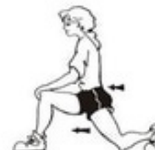
23. Hip Flexor Stretch (keep back straight, tuck bottom under, lunge forward on front leg)