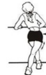
24. Tensor Fascia Stretch (continue to push bottom forward, whilst pushing hip to the side)