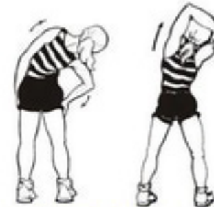
11. Lateral Flexion Stretch (one side, then the other, push pelvis across as you bend)