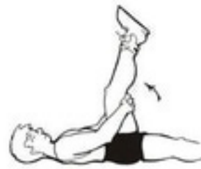
15. Hamstring Stretch (straighten leg) i. with foot pointed ii. with foot pulled back towards the knee