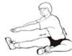
16. Hamstring Stretch (commence with knee slightly bent, then push knee straight as tension allows, push chest towards foot)