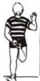
21. Quadriceps Stretch