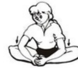
17. Adductor Stretch (push down with elbows on knees very gently, keep back straight)