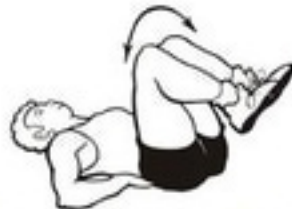
14. Lumbar Rotation Stretch (rotate legs one side, then the other side, draw in and brace stomach muscles at the same time, breathe)