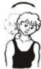
2. Neck Lateral Flexion Stretch (one side, then the other)