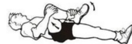
18. Gluteal Stretch (pull knee and lower leg towards opposite shoulder)