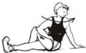
19. Gluteal and Lumbar Rotation Stretch