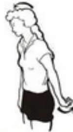
9. Wrist Extensor Stretch (tilt head to opposite side, keep elbow straight)