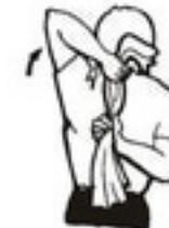
5. Shoulder Rotator Stretch (using towel, pull up with the top arm then down with the other)