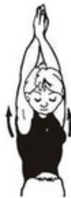
3. Latissimus Dorsi and Posterior Deltoid Stretch (link hands, push elbows together)