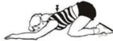
10. Thoracic Extension Stretch (reach forward with arms, push chest towards floor, arch back down, backside behind knees)