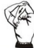
4. Triceps Stretch (pull elbow across and down)